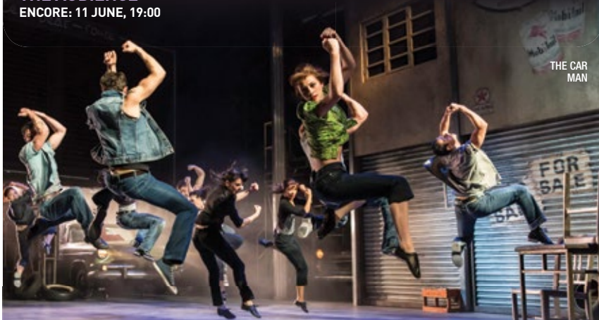
THE CAR MAN